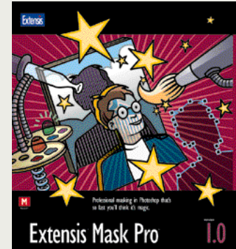
Extensis Mask Pro: Photoshop's Mask Creation Plug-in